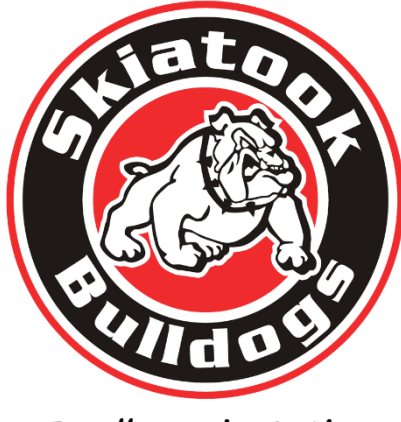
Excellence in Action